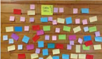
The ideas wall captures the key things people are taking away from the conference to use in their roles.